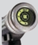
Variable Brightness Full, 1/2, 1/3 and 1/6