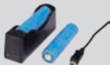
USB Charger Charges from included wall adapter or any USB power cord