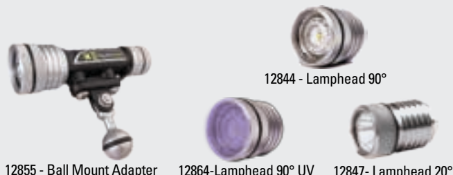
12855 - Ball Mount Adapter